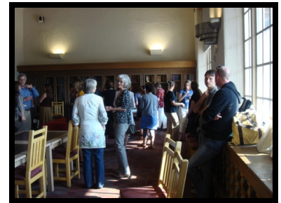
SEI 2011 Reception

As part of its educational outreach the Foundation co-sponsored the 2011 VRA annual conference plenary session on educational fair use featuring intellectual property expert Jule Sigall. During the conference our Gold, Silver, and Bronze