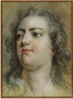
Louis XV Subject-Of