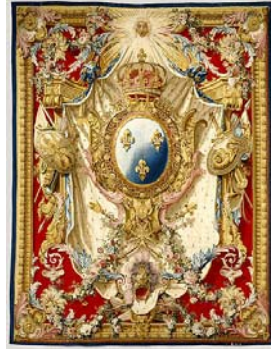
Louis XV Subject-About